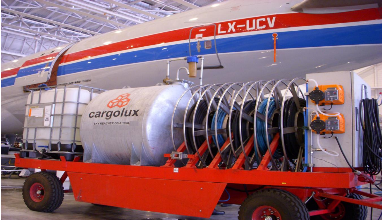
ETS - SKYREACHER TYP GS T 1000